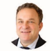
Paul Starr King & Wood Mallesons