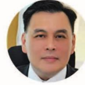
Soh Lieh Sieng Contract Solution-i